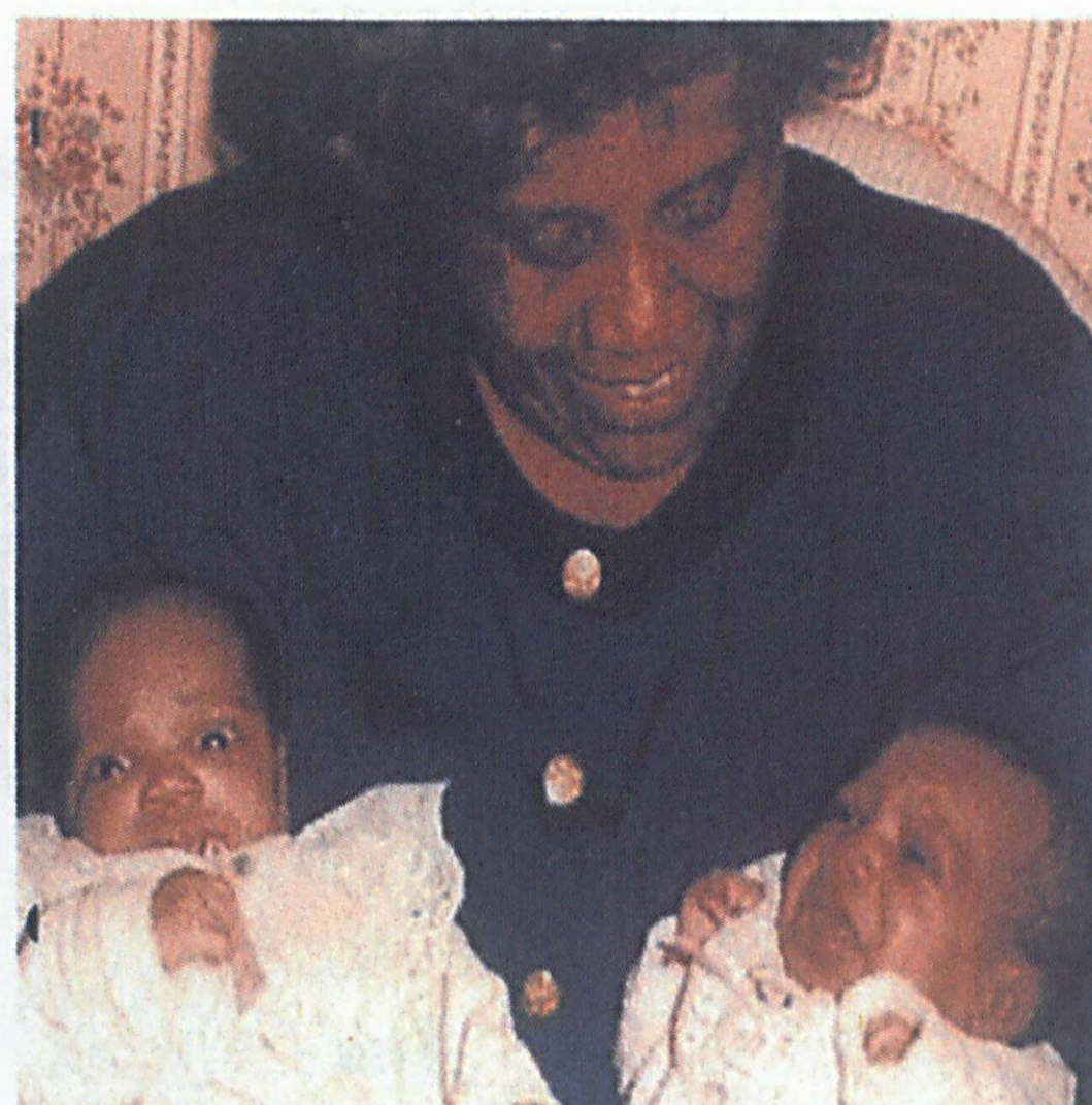
...with Belinda's Twins