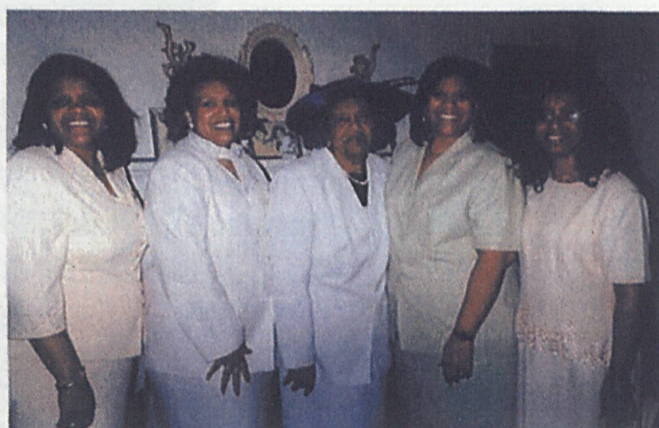
....with the girls at Easter 2001