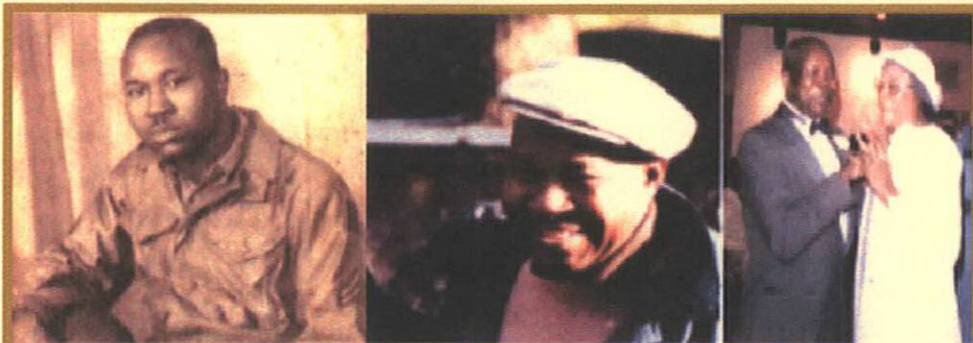
Young Coporal Where's my cigar? Lovers Forever