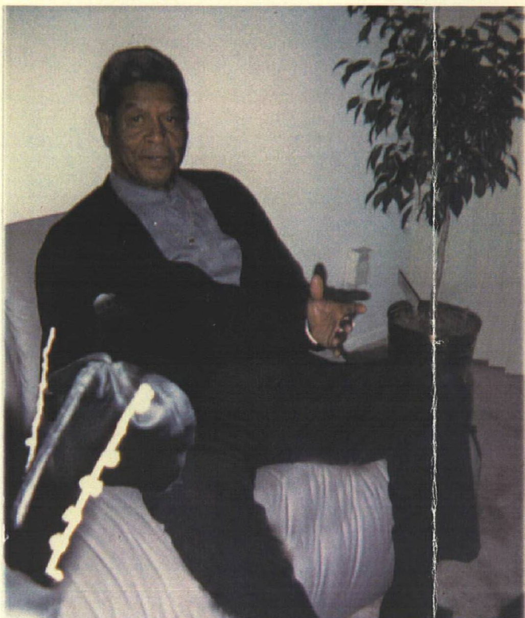
Miss Me, But Let Me Go

When I come to the end of the road And the sun has set for me, I want no rites in a gloom-filled room, Why cry for a soul set free?