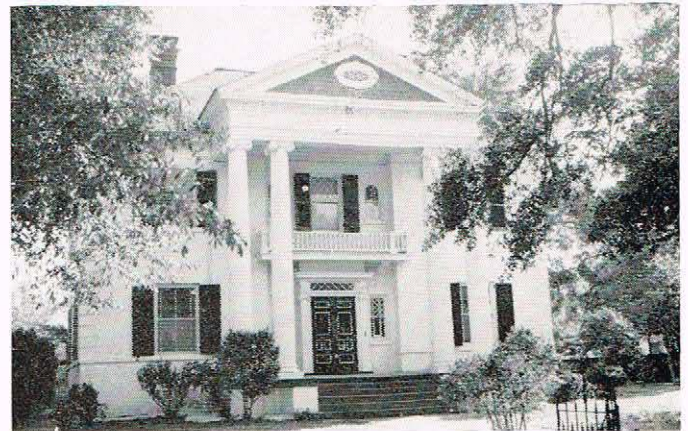
The house at 510 Orange Street, formerly the Episcopal See House, contains now the new offices and studios of radio station WMFD. The exterior retains its classic charm, and the interior has undergone a few minor adjustments for its new function.