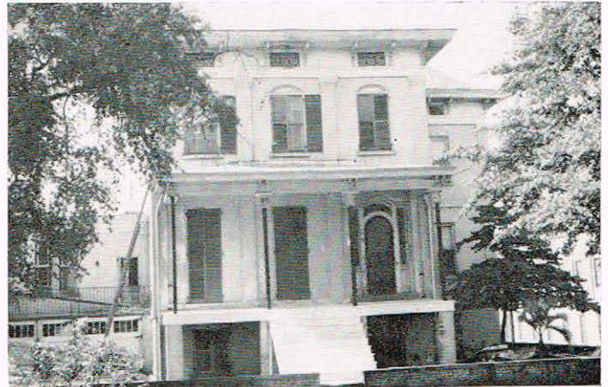
The von Glahn House at 19 North Fifth Avenue is being refurbished to house some of the City's administrative offices. Restoration of the house, built over a hundred years ago, is a good example of the work being carried on in the Historic District.