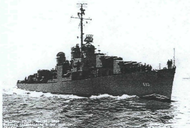
USS Cooper , in New York before commissioning.