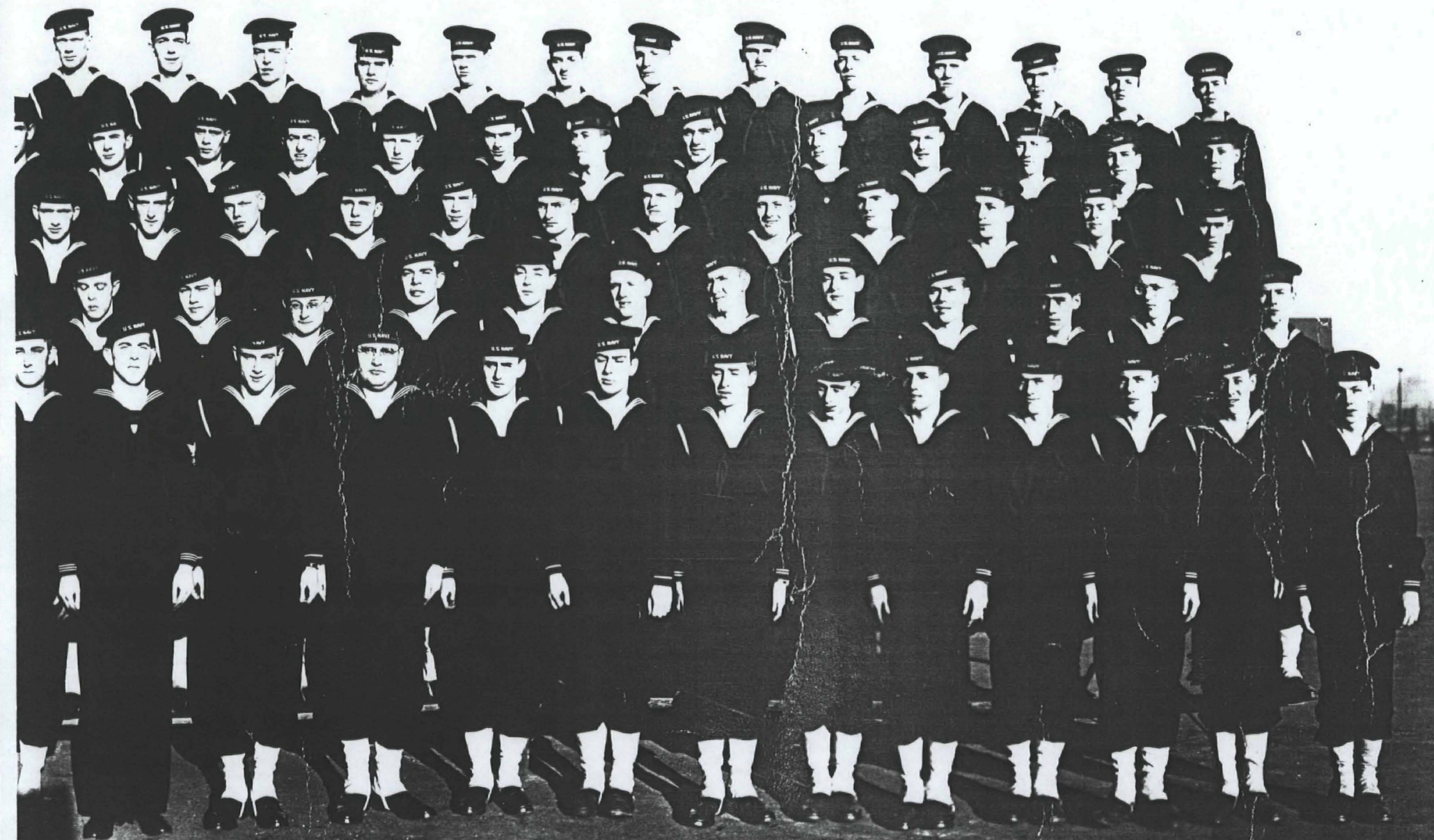
LEY-SP.(A) 3 / c -CO.CMDR.-FEB.24,1945. ING CENTER-GREAT LAKES, ILL.