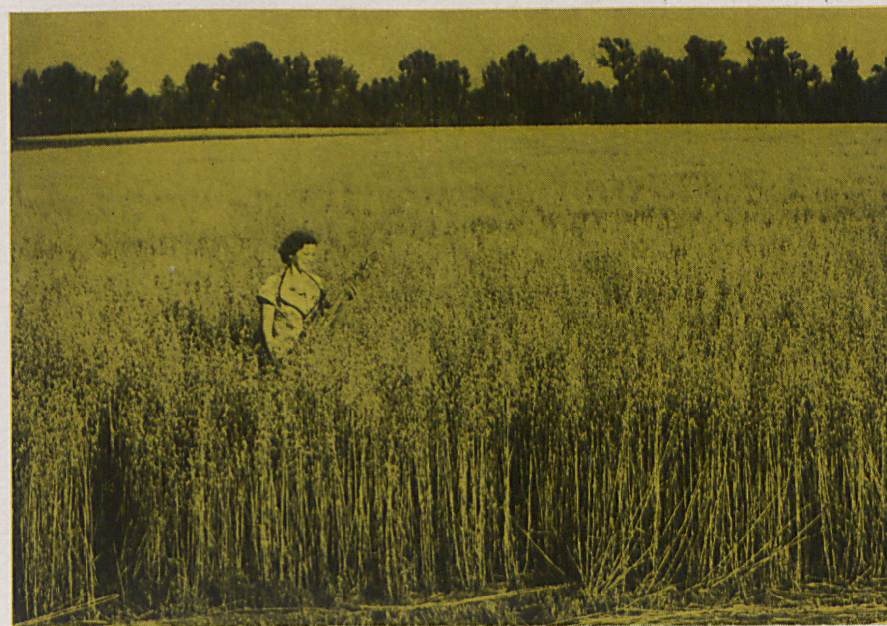
The above photograph shows one of our fields of Arlington Oats. Notice how well they stand at maturity.

Of particular importance is its stiff straw, which makes it ideal for combining. Arlington is adapted to the Coastal Plain and Piedmont and has been found sufficiently winterhardy for the upper Piedmont and possibly the lower Mountain sections.