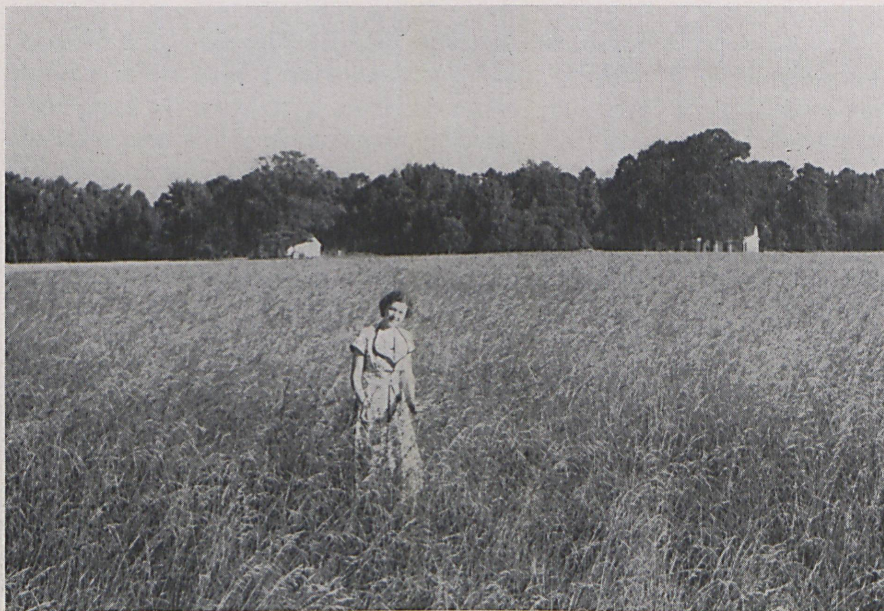
The above picture shows the original field of Registered Kentucky 31 Fescue in North Carolina, located on the Watson Farms.