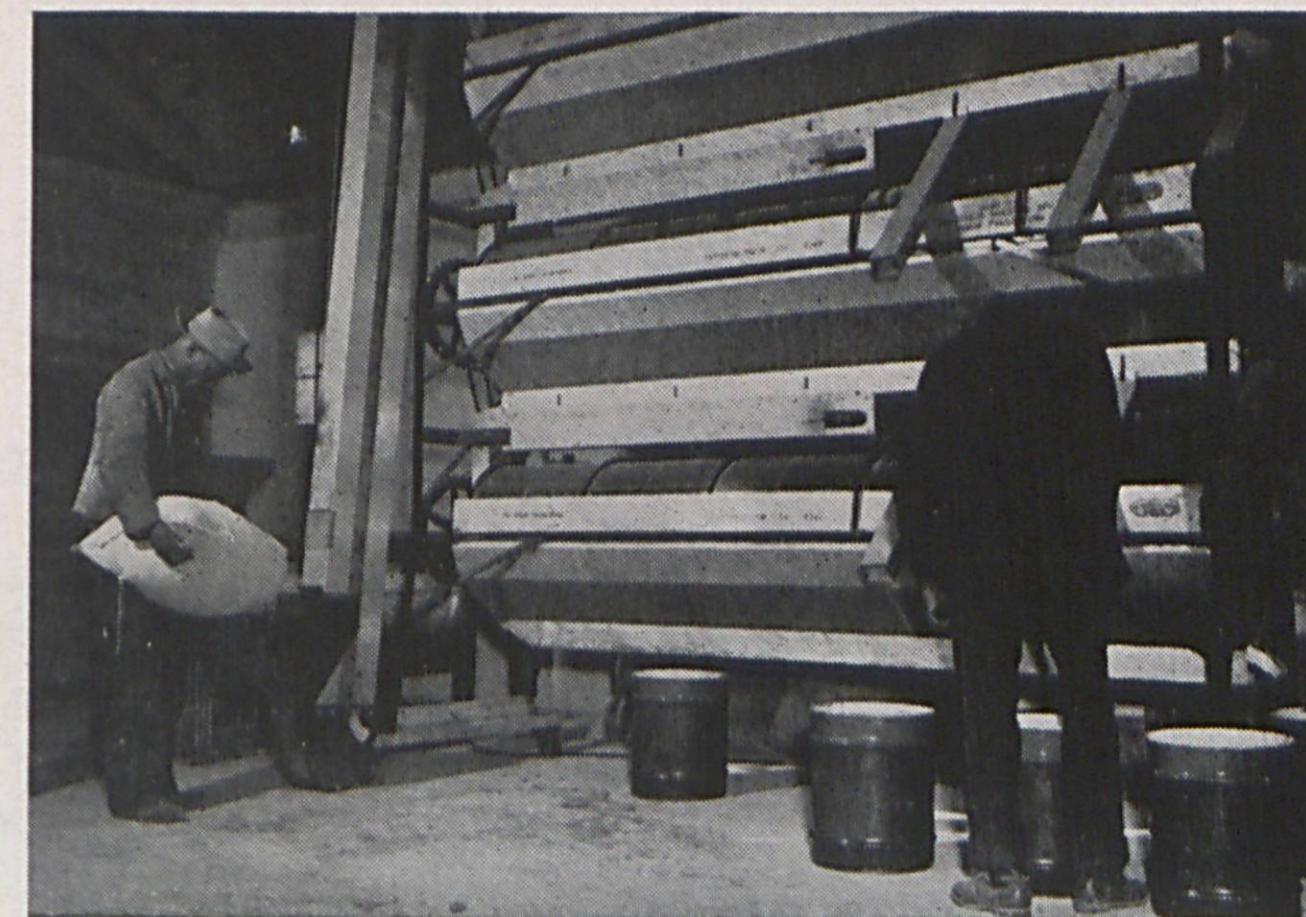
GRADING SIZES AND SHAPES

Approved Growing Methods Assure Seed of Good Germination and Highest Yield-Quality