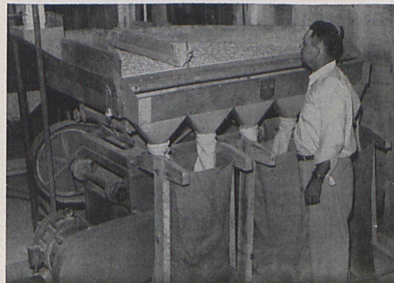
GRAVITY SEPARATOR REMOVING LIGHT SEED AND CHAFF

The growing and processing of pure seed is an exacting and scientific job. Germination and productivity depend on how well these jobs are done. All Watson seed are grown on our farms under the personal supervision of a trained plant breeder. No amount of time or effort is spared to guarantee that you get the best seed obtainable when you buy Watson seed. All Watson Purebred Seed have been carefully field inspected and tested to assure strong germination and highest yields.