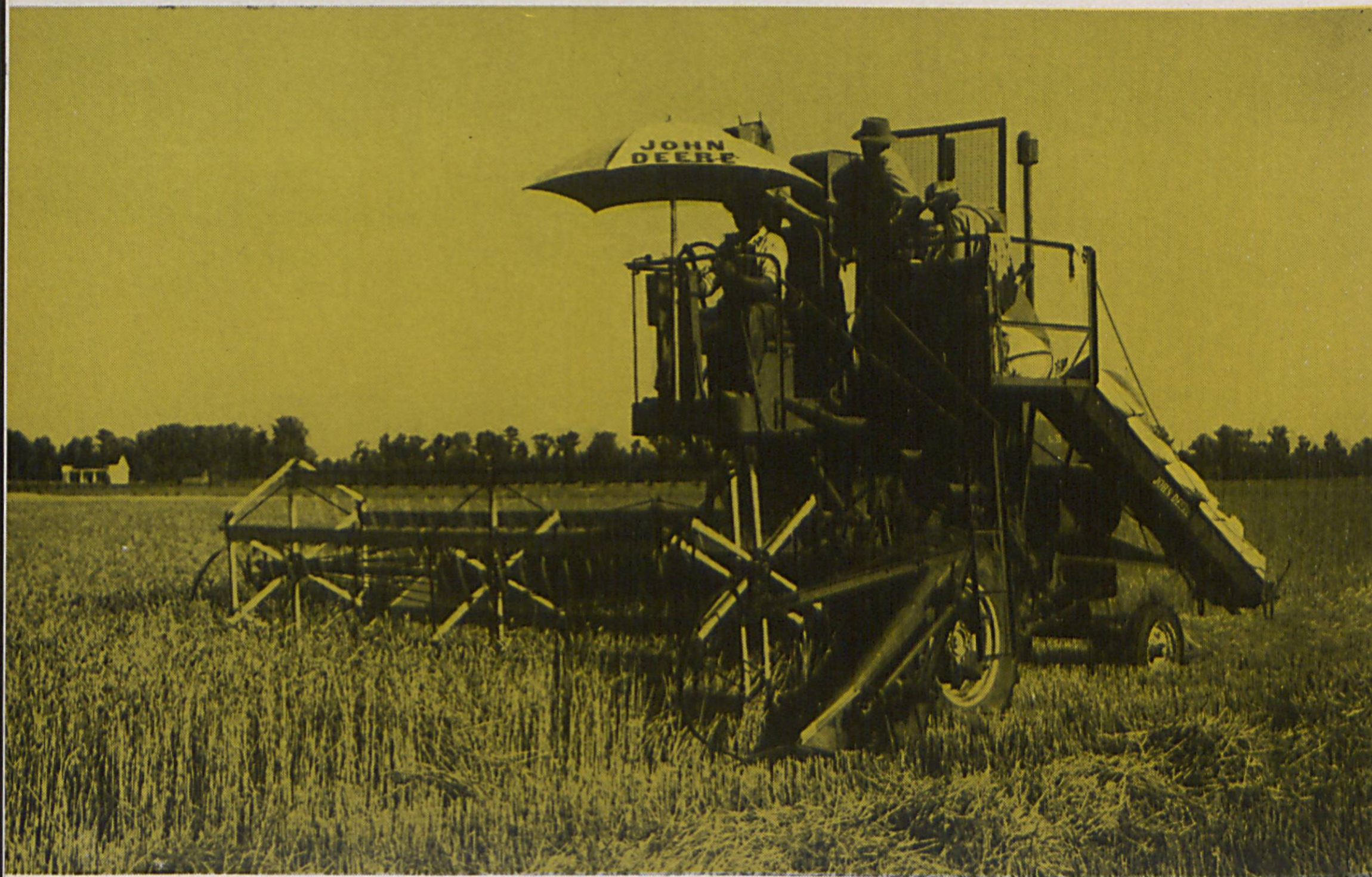
Good yields with a wide range of adaptability. Short, stiff straw for easy combining.

Colonial Barley has several desirable qualities that make it well adapted to the area which is roughly South and East of a line running from New York State to Central Texas. During the past two years it has been widely tested in this area. Each year it has produced the highest yields of any variety tested, indicating a wide range of adaptation. Of special importance is the ability of Colonial to stand up until ready for combining. Colonial St. 2 is resistant to some local races of powdery mildew and has some tolerance to leaf rust. It has stood satisfactorily where Sunrise barley has lodged badly because of rust. Even under severe rust conditions it has stood to maturity, whereas other varieties lodged. Colonial has the shortest, stiffest straw of any variety now grown in this general area. Its ability to stand to maturity, even under some adverse conditions, plus its high yield ability, make Colonial one of the most ideal barleys that you can plant.