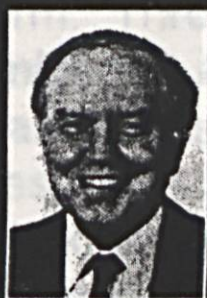
STEPHEN L. NEAL 5th District