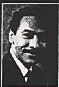
MELVIN WATT 12th District