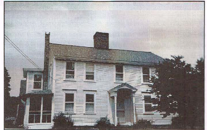
Jozeb Stocking House