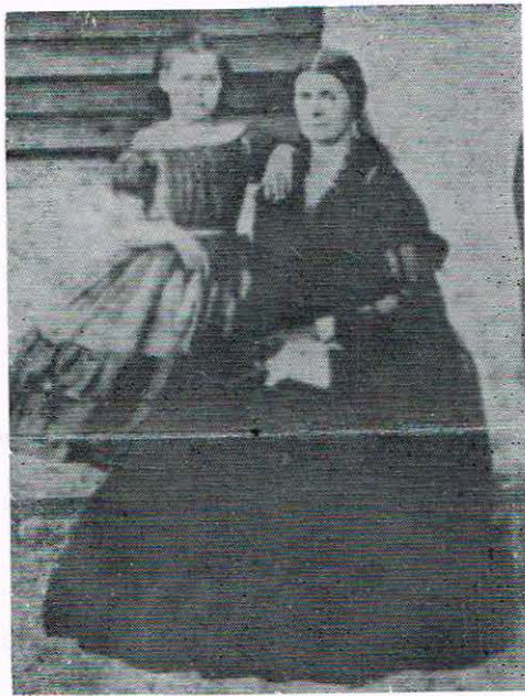
Rose O'Neal Greenhow and daughter Rose

Probably the best biography of Mrs. Greenhow is: "REBEL ROSE, Life of Rose O'Neal Greenhow, Confederate Spy", by Ishbel Ross; published by Harper & Brothers, New York, 1954.*