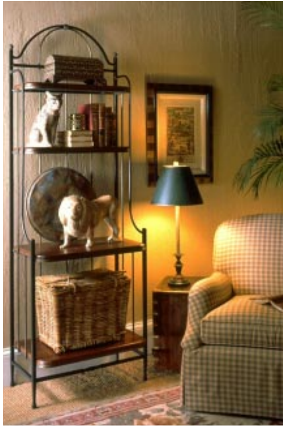
FIGURE 17. Blackberry Road Collection, (Occasional) Charleston Forge, designed by Thomas McDaniel/Scott Coley, ASFD

The Blackberry Road Dining Collection features an english cottage style in a mix of wood and iron. The collection consists of seven pieces: an oval cocktail table, rectangular cocktail table, a tea stand, a rectangular end table, a console table, a corner television stand with VCR storage, and a small baker's rack.