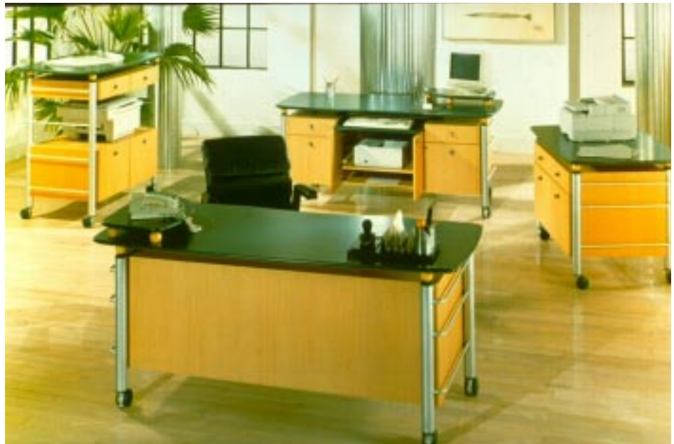
FIGURE 24. Milano Collection, Bush Furniture, designed by Joe Miller

The Milano Collection is an avant-garde, ultra-modern line of functional office furniture. Set on 3" casters to allow for easy placement, each piece is styled in satin-finished tubular steel end frames and finished with Euro Beech and Jade Green WearGuard™ finish. the collection achieves innovative and functional design at low price points.