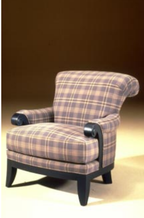
FIGURE 7. 792 Chair, Pearson, designed by Bruce Ward

The 792 Chair combines sophisticated, transitional design with a unique silhouette and empire detail. Exposed wood is ash, with an exaggerated carved scroll arm and outward-sweeping tapered legs. The upholstery features a rollover saddle arm, pleated rollover tight back, and plush loose seat cushion.