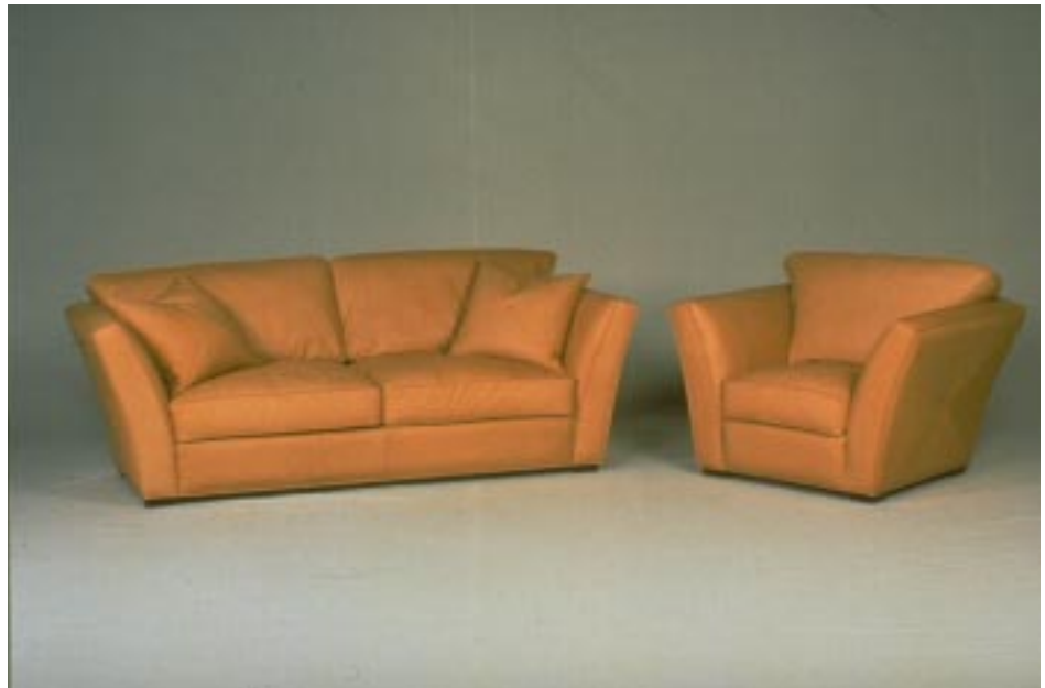
FIGURE 6. Tiffany, LeatherTech, designed by Mark Mascheroni

Designated as a “Best of Market” product by Furniture/Today in October 1996, the Tiffany blends contemporary and traditional elements to create a look of classical elegance. It was designed to look and feel comfortable while providing a larger scale architectural presence in a room. Large, boldly scaled “X” patterns on