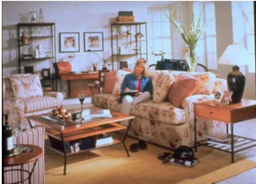
FIGURE 18. Lofty Living 92000 Group, Hammary Furniture Co., designed by Berry and Clark Design Associates

Every piece in the Lofty Living collection is designed for fresh, functional solutions for today's comfortable interiors. A fantastic assortment of occasion tables, casual dining, home entertainment, and home office allows busy families to make their homes personally distinctive, practical and livable.