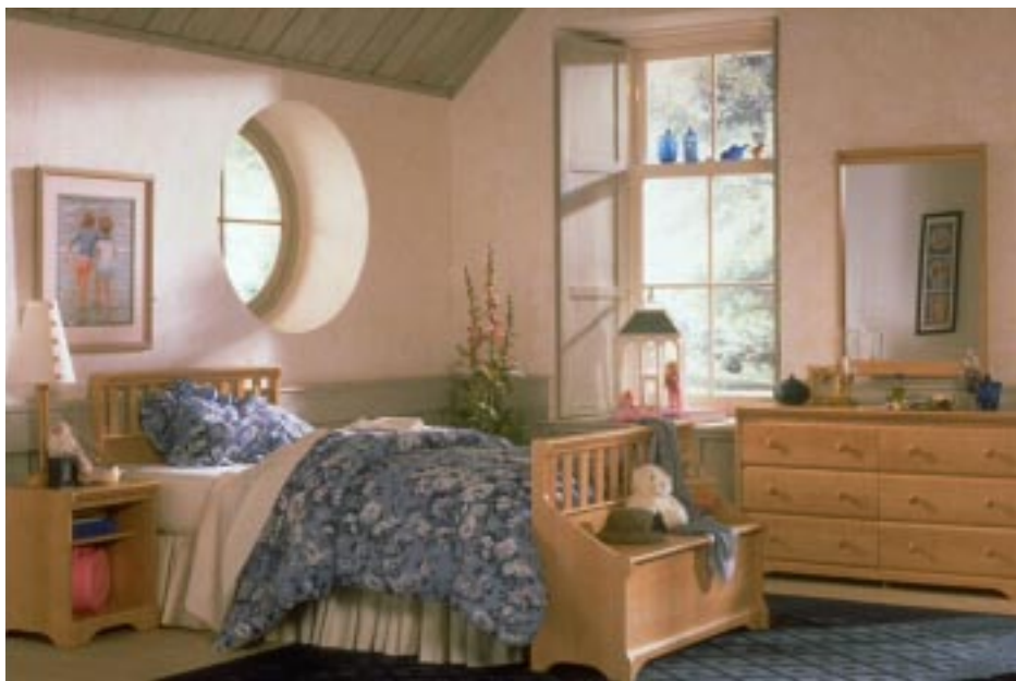
FIGURE 12. Sand Castle Collection, Sauder Woodworking Co., designed by Douglas Krieger/Michael Lambright

Engineered with kids in mind, this collection is a new concept in youth bedroom. Interlocking drawer mechanisms allow only one drawer to be open at a time. The extended base increases stability, providing parents with peace of mind.