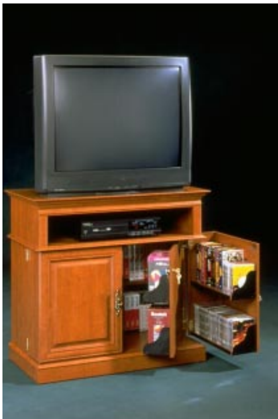
FIGURE 19. Belmont 6451 Entertainment Stand, Sauder Woodworking Co., designed by Michael Lambright/Douglas Krieger

The 6451 features elegantly drawn hardware with a polished brass finish, delicately detailed trim moldings, and raised-panel doors. The finish is a warm fruit-wood. Forward-looking functions have been incorporated in this design. They include 3Deep™ storage for tapes and CDs, locking inner doors, and advanced assembly systems that make it as easy to put together as to look at.