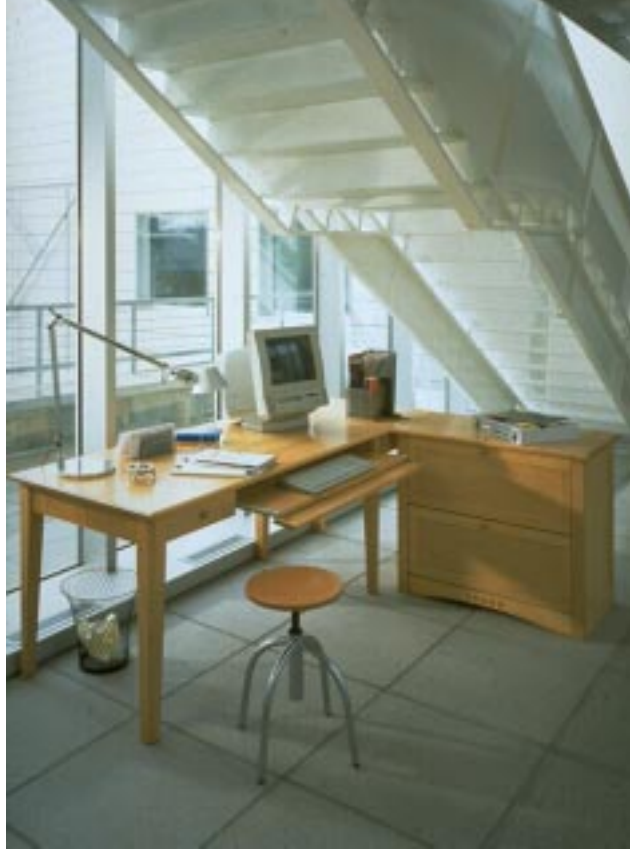
FIGURE 23. Ungava 55, Baronet Inc., designed by Vell Hubel/Alain Juneau

The Ungava 55 is made of maple and birch, with a rich finish that works well in either a contemporary or traditional home. It is detailed with tapered legs, chamfered edges, and solid wood drawer pulls.