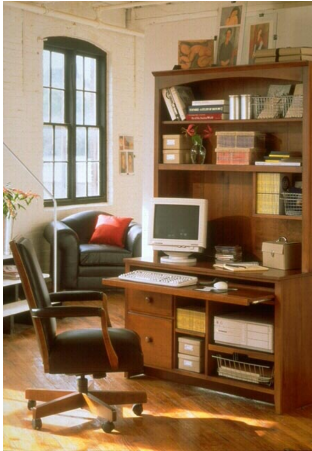
FIGURE 22. Country Colors—EA Organizer, Ethan Allen, designed by Irving Sabo/Craig Stout

The EA Organizer home office system was introduced in December 1996. In developing the LA Organizer, designers were challenged to create the most versatile home workspace possible. The system had to suit children as well as adults, small as well as expansive spaces, people with an abundance of office equipment and books as well as those with only pencils, paper and files. Units had to consider current technological requirements while anticipating future needs. Stylistically, the components were expected to fit comfortably into most room settings.