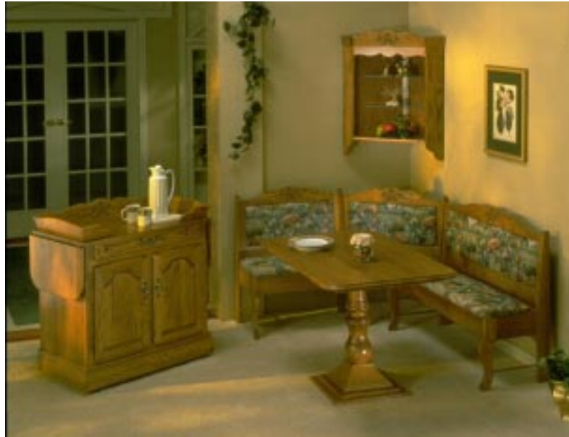
FIGURE 15. Victoria Dining Nook, Conestoga Wood Inc., designed by Stephen Donoho

In response to customer requests, the Victoria Dining nook feature a larger seating area and sophisticated French country styling. the solid turned pedestal is a spectacular design element the complements the french-curved backrests that showcase an exquisite handcarved floral motif.