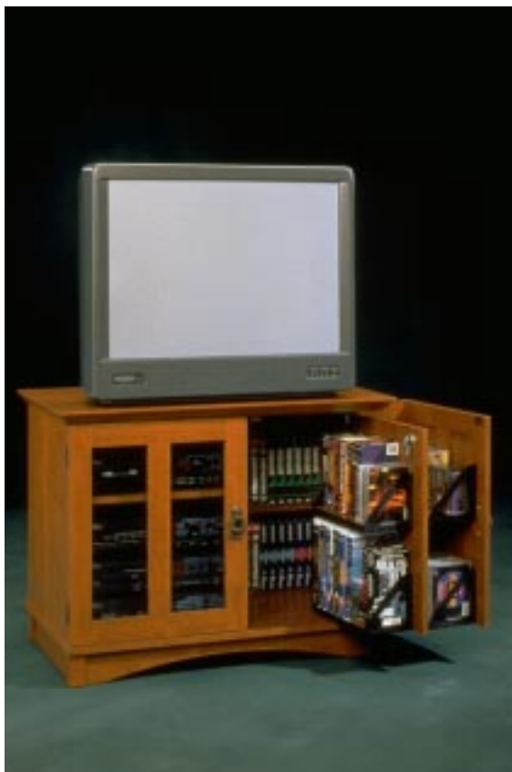
FIGURE 20. 8452 Entertainment Stand, Sauder Woodworking Co., designed by Michael Lambright/Douglas Krieger

The solid simplicity of mission style makes this stand versatile enough to blend with any decor. It features fruitwood finish with hammered-look metal hardware and patent-pending 3Deep™ storage. An adjustable shelf behind a framed, safety-tempered glass door holds audio and video components.