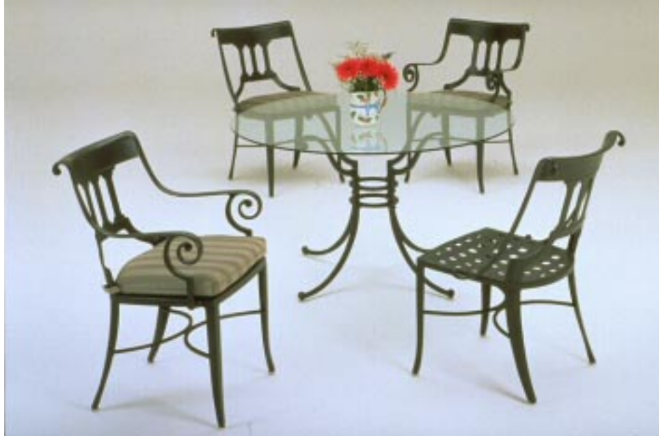
FIGURE 14. Empress Arm Chair, EM11A, Veneman Furniture, designed by John Caldwell, ASFD

The Empress Group is a brand new concept with the classical look of Empire style furniture of the early 19th century. The style uses rectangular shapes and ornamental motifs to appear massive and regal. The group features durable cast aluminum construction, making it weather resistant and rust-free.