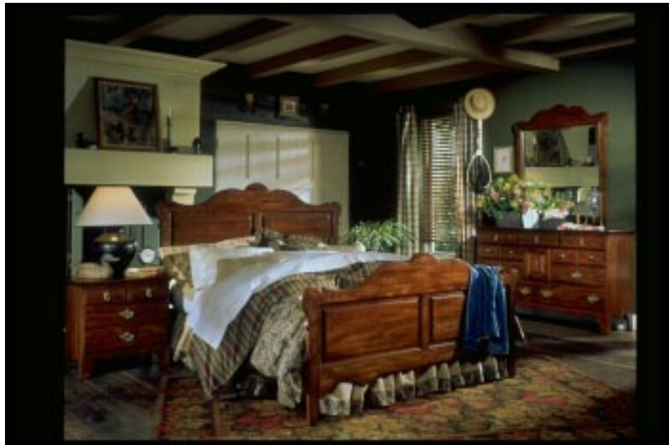
FIGURE 1. Whalehead Oak, Kincaid Furniture, designed by Tim Annas

This collection has a solid oak distressed antique finish with casual styling. The 46 pieces include bedroom, dining room and occasional furniture. A portion of the proceeds benefits Ducks Unlimited.