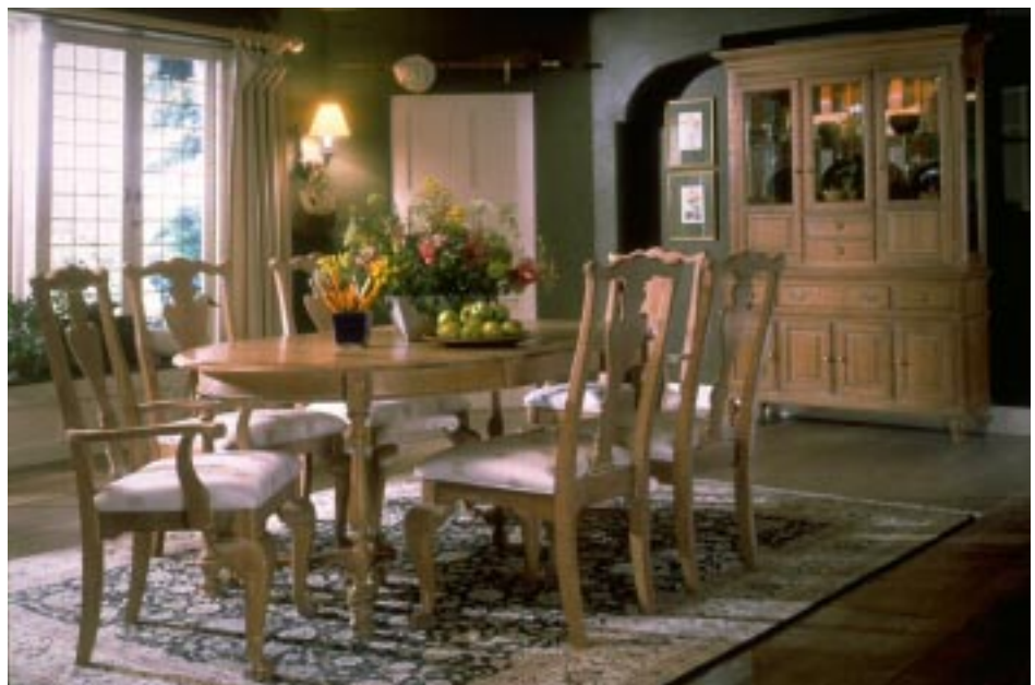
FIGURE 2. Currituck Cherry, Kincaid Furniture, designed by Tim Annas