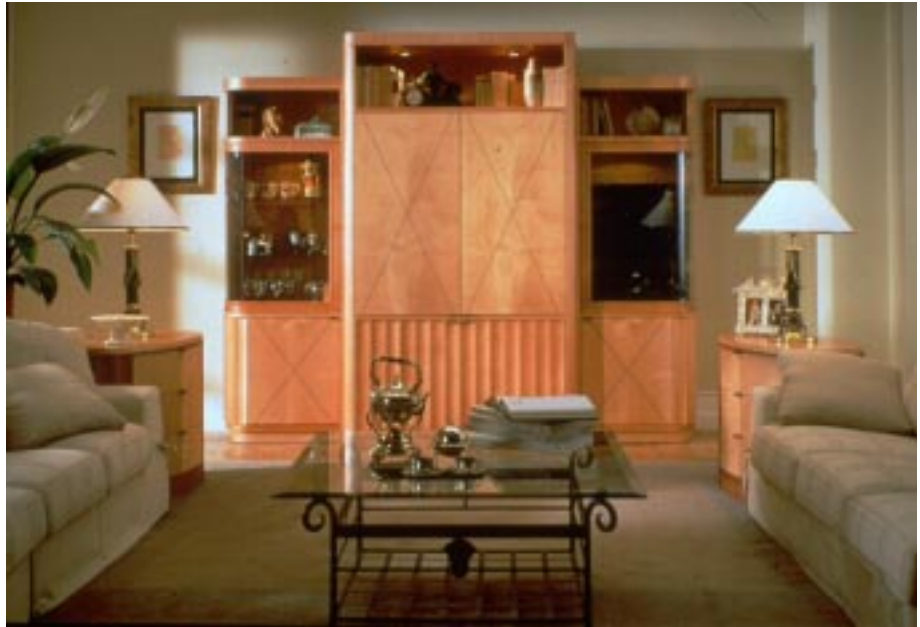
FIGURE 3. Intarsia, Planum, designed by Berry and Clark Design Associates

The Intarsia collection features sculptural lines, sensual contours, delicate details and a sophisticated harmony. Classical architectural details include large fluting from classical Greek columns, curvilinear shapes from 20th century architecture, veneer inlays and cast brass hardware. Figured maple veneers, ebony inlay lines, and mother of pearl inlays are used with natural finishes to enhance the beauty of the woods.