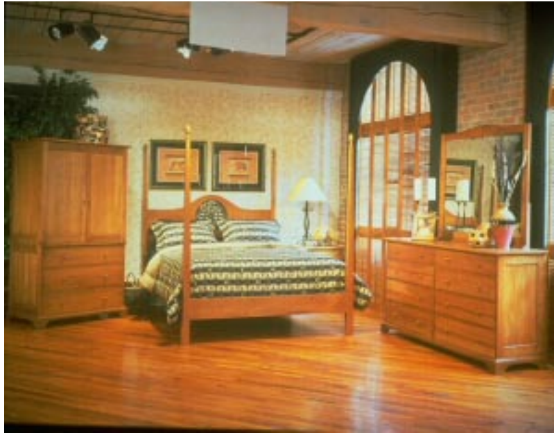
FIGURE 11. Passages 970, Durham Furniture, designed by Steve Hodges, ASFD

The 970 Passages collection blends elements of Shaker, Arts & Crafts and contemporary styles. Constructed of solid cherry, the group is available in two finishes. Natural, a clear stain accentuates the grain of the selected cherry lumber, and Candlelight, a rich reddish-brown. Cases have graduated fitted drawers set off by custom flat-grained cherry knobs, ergonomically located near the center for ease of opening. Framed 3/4" solid end panels are accentuated by a small chamfer on the outside edge of the pilasters and sculptured undercut 5/4 tops. Several pieces have cedar drawer bottoms to protect fine garments.