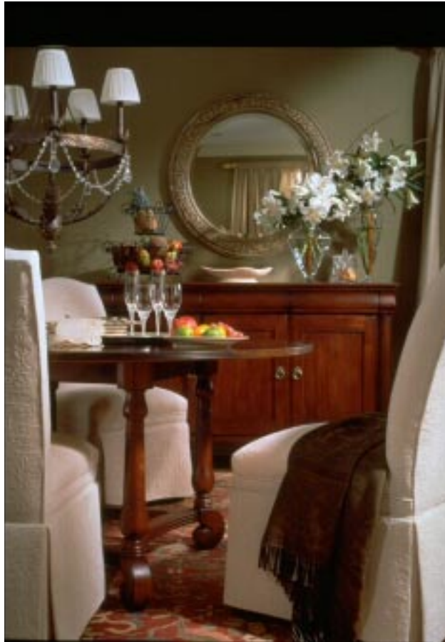
FIGURE 4. British Classics, Ethan Allen, designed by Irving Sabo/Craig Stout

Designer Irving Sabo/Craig Stout Manufacturer Ethan Allen Ethan Allen Drive Danbury, CT 06813 Phone: 203/743-8000 FAX: 203/743-8298 Retail Price Not Available