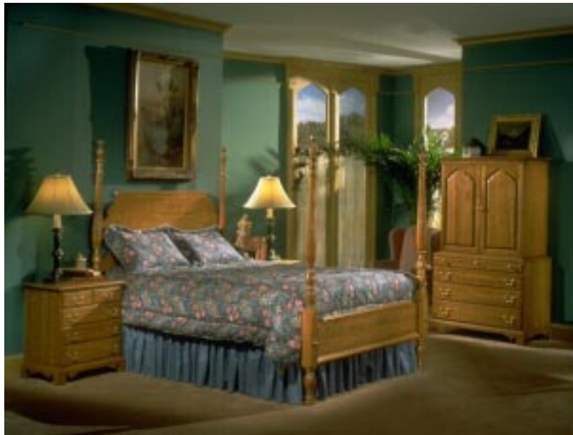
FIGURE 10. Homestead 950, Durham Furniture, designed by Steve Hodges, ASFD