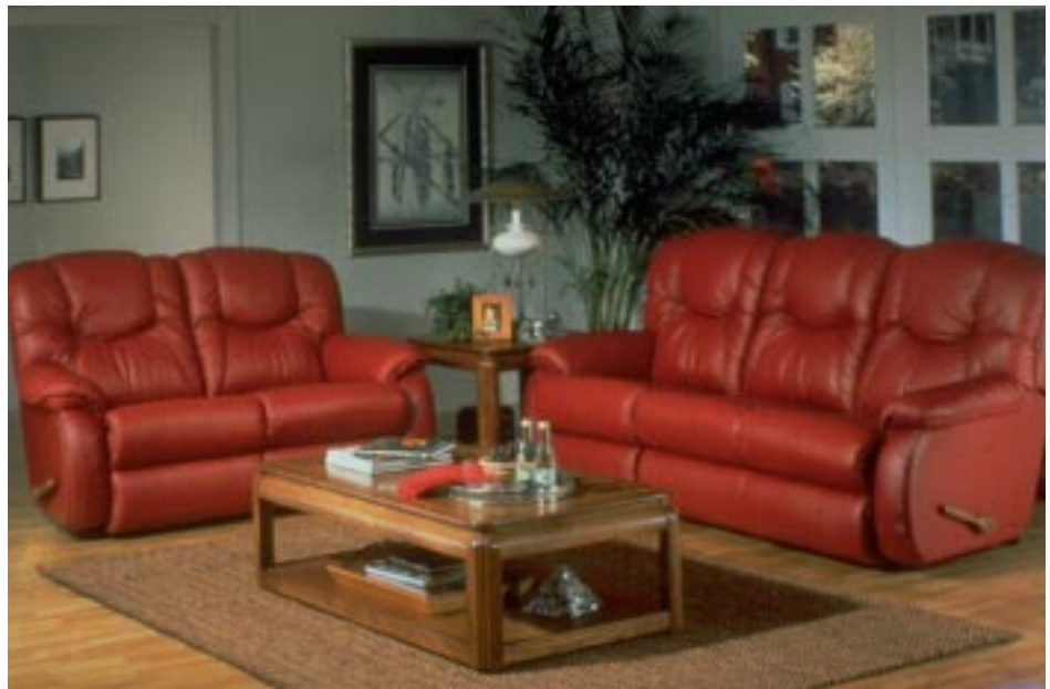
FIGURE 9. Dreamtime 554, La-Z-Boy Inc., designed by Jack Lewis, ASFD

Dreamtime 554 features bold compound-curved front posts that are heavily padded and shirred. an overstuffed back offers unique curvilinear sew lines which are precisely positioned and deeply drawn. Soft pillow arms nestle beside a chaise pad seat.