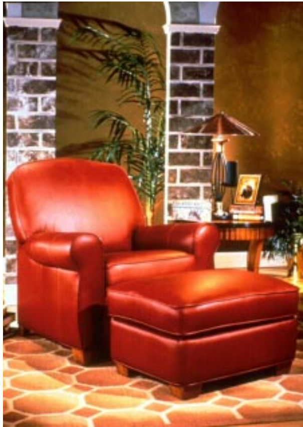
FIGURE 8. Manhattan 15005, Action Industries, designed by Carl Schauble, ASFD

The Manhattan was created for the casual contemporary customer. The line of the arm sweeps around the top and gently flows out along the side. These curves are continued in the lines of the back, to form a crowned back cushion. Tapered solid maple block legs are finished in honey maple. Boxed welted cushions with soft foam cores are offered in both leather and fabric.