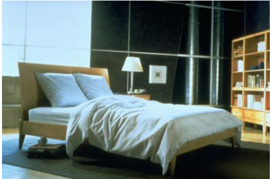
FIGURE 13. Ungava Nordic Bed, Baronet Inc., designed by Vell Hubel/Alain Juneau

Beautiful in its simplicity, this bed is available in solid maple and birch veneer. It is a structural piece of geometric perfection.