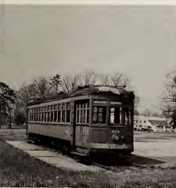
STREETCAR Once Made in High Point Now a Show Piece