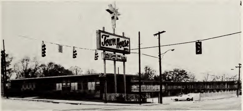
TOWN HOUSE MOTEL 400 South Main Street