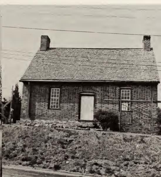
ONE OF THE OLDEST HOUSES IN HIGH POINT Now Restored as a Historical Place

A NEW MUSEUM IS BEING CONSTRUCTED ON THIS SITE