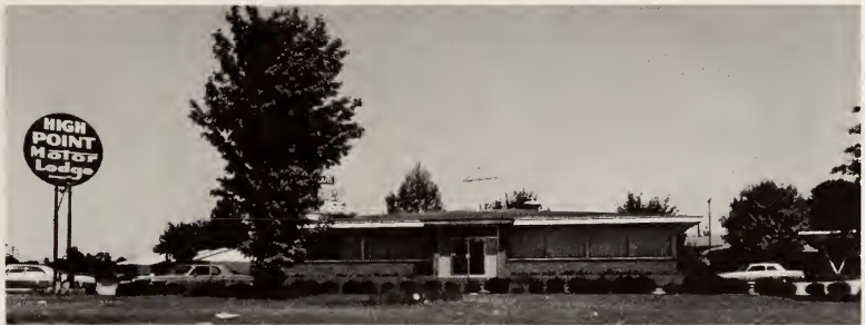
HIGH POINT MOTOR LODGE South Main Street at I-85