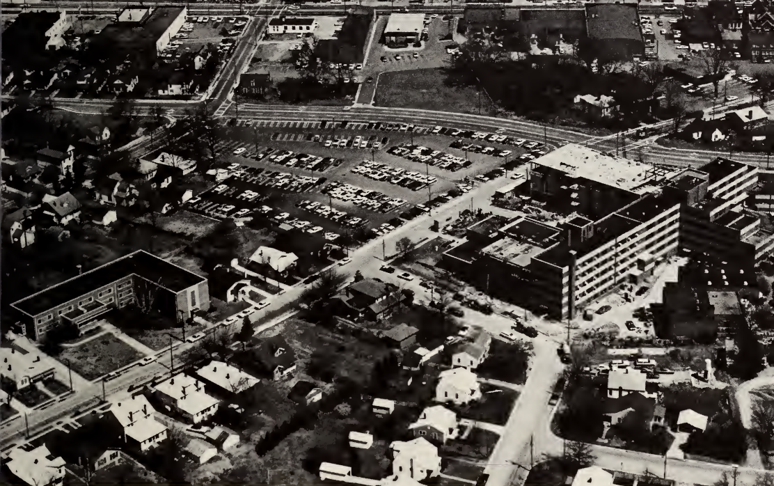
HIGH POINT MEMORIAL HOSPITAL OF 357 BEDS Nurses Home at Left