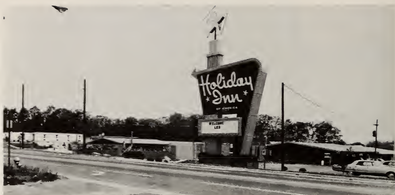
HOLIDAY INN West Green Drive Extension