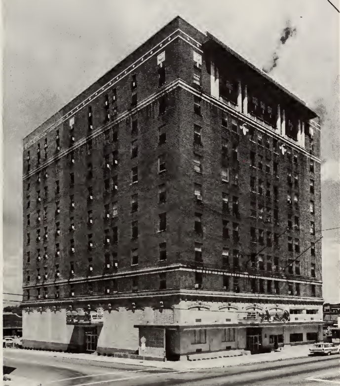
SHERATON HOTEL 314 North Main Street