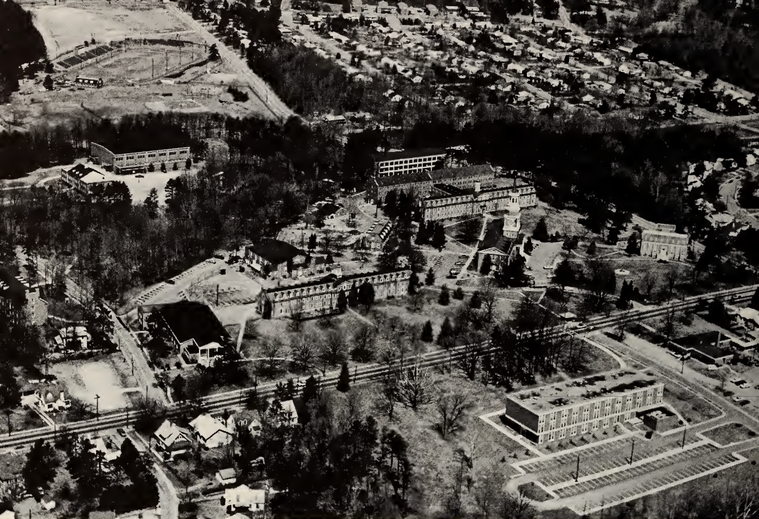
HIGH POINT COLLEGE Co-educational—1200 Students—Founded 1924