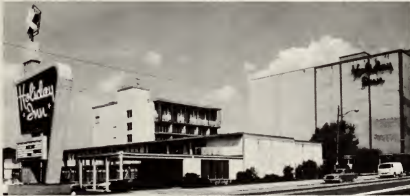
HOLIDAY INN Downtown 236 South Main Street