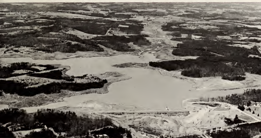
NEW CITY LAKE Started in 1969—Will Store 3 Billion Gallons Of Water

2.0 acres on Gordon Street with 2 lighted tennis courts and children's playground area.