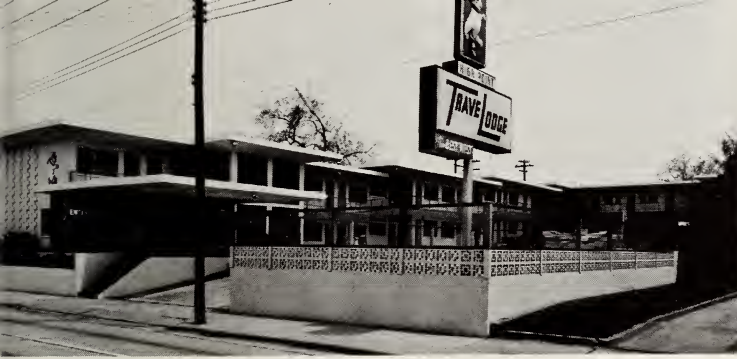
TRAVELODGE MOTEL 425 South Main Street