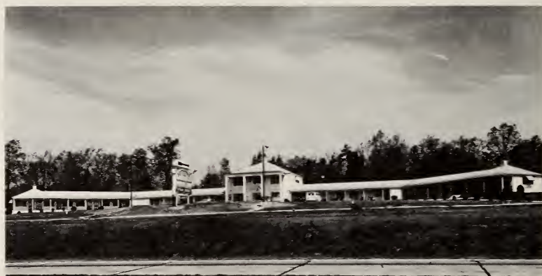
COLONIAL MOTOR INN Highway 29-70 South and I-85